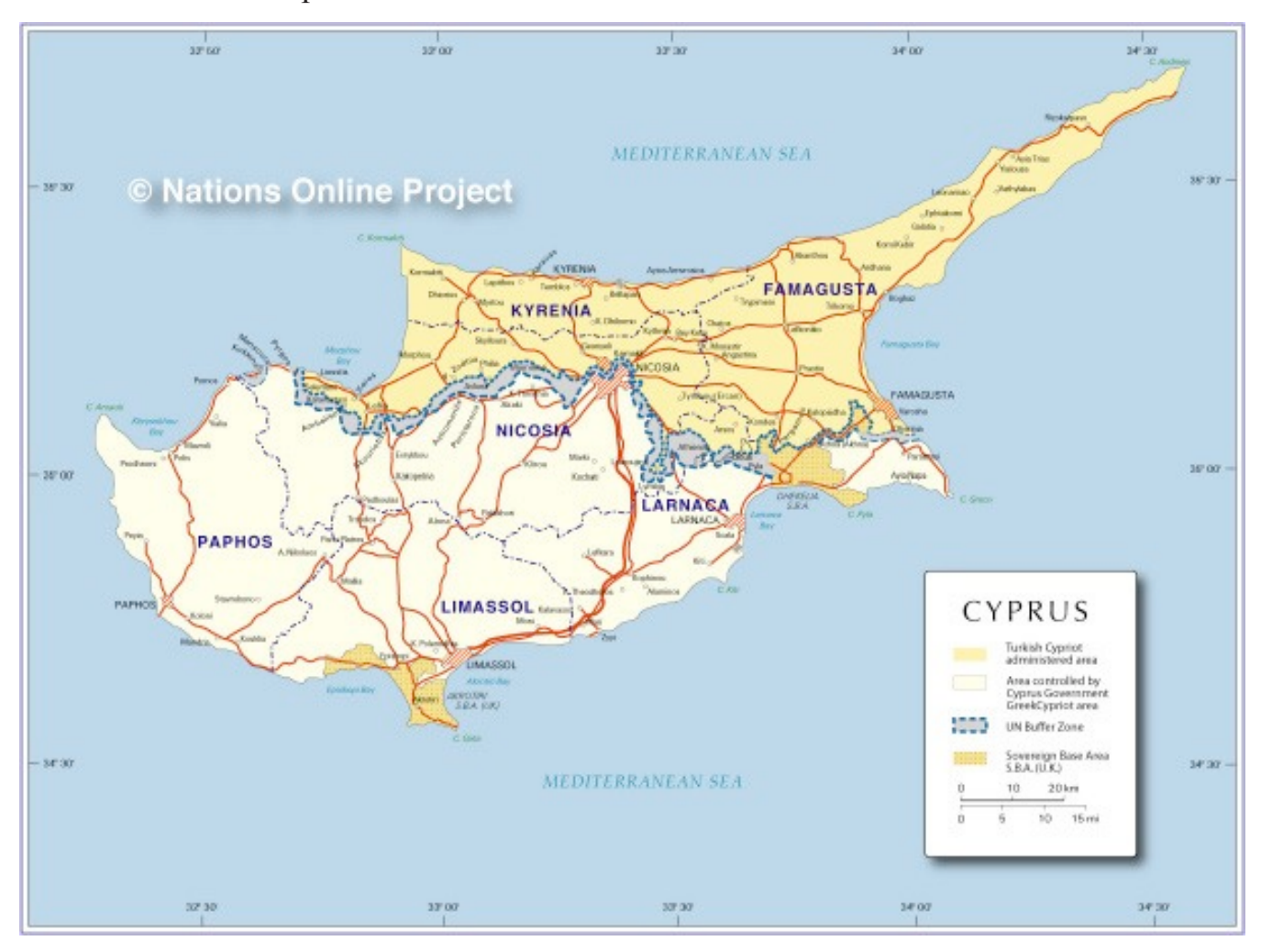
Map of Cyprus.