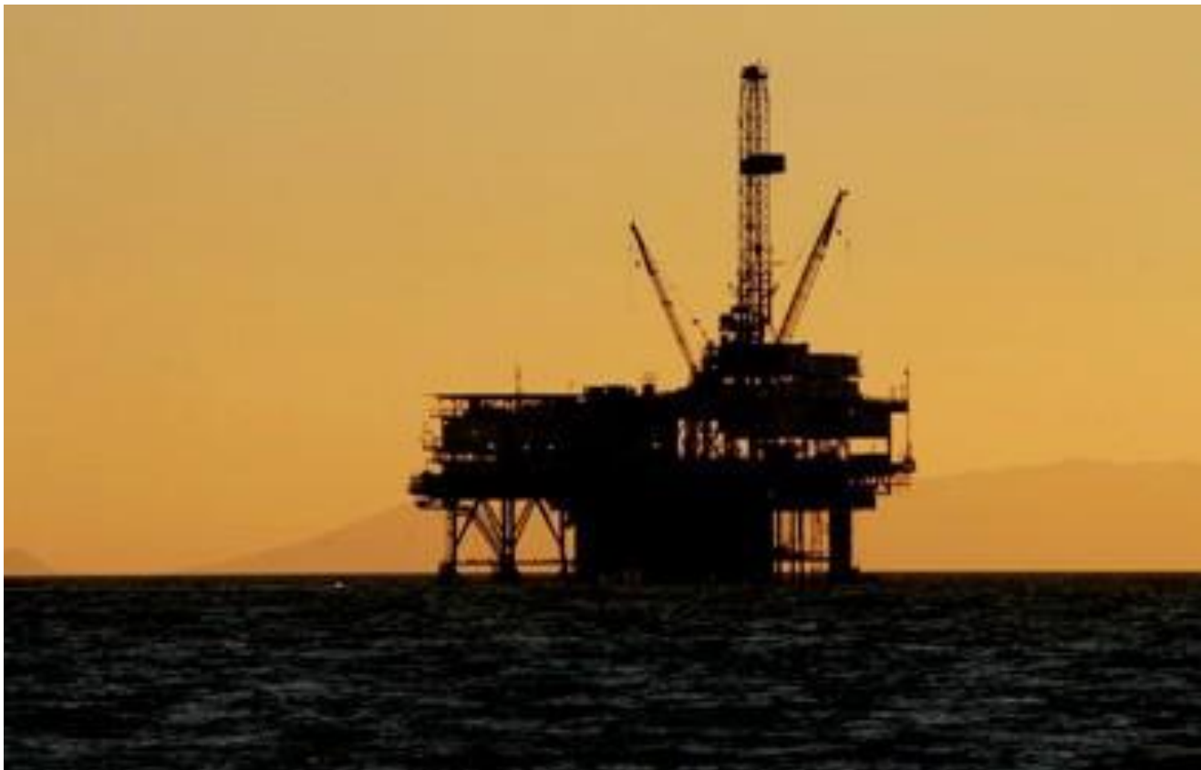
Marine Oil and Gas Drilling Platform.

Times are approximate, estimated according to typical class size and class period duration; the structure and duration of the activity can be modified to fit different schedules and class sizes.