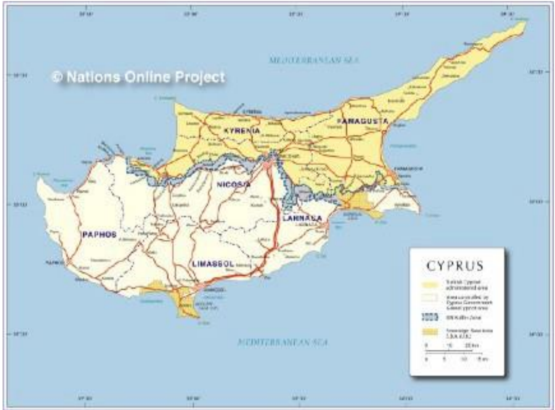
Map of Cyprus.

All students should search their own party's English-language news sites for articles related to the conflicts and resource issues most important to their party. This can be done through keyword searches ("natural gas," "offshore drilling," "Law of the Sea," "Cyprus conflict," "Leviathan," "Aphrodite," "EEZ," etc.).